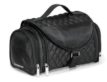
Brookstone® Ladies' Amenity Case