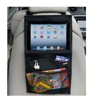
High Road iPad® Car Entertainment Station