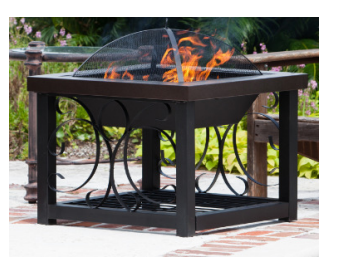
FireSense® Hammertone Bronze Finish Cocktail Table Fire Pit