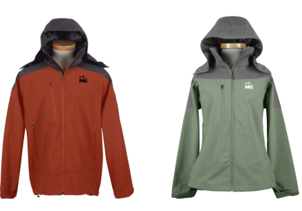
Windproof/Water resistant Jacket Features Walk MS logo Optional Chapter Name Personalization