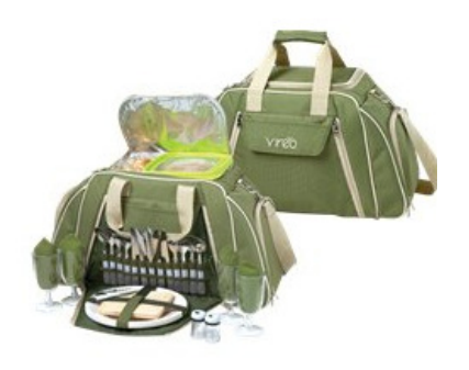
Picnic Duffel for 4 Features Walk MS logo