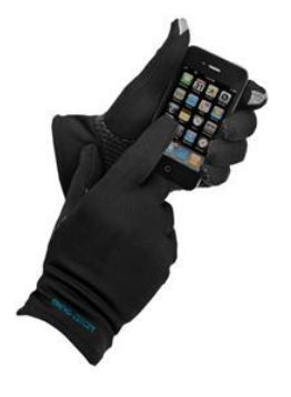
Isotoner® smarTouch® Gloves Features Walk MS logo