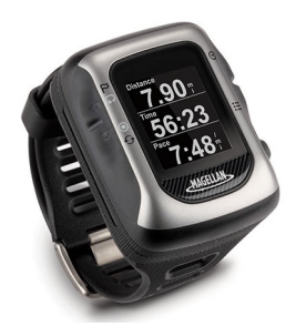
Magellan® Deluxe Crossover GPS Watch with Multisport Mounting Kit