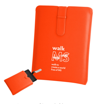
Lunar iPad Sleeve Features Walk MS logo