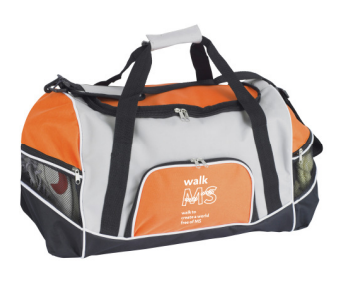
Tri-Pocket Sport Duffel Features Walk MS logo