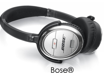
Noise Cancelling Headphones