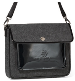
Chloe Computer Messenger Bag Features Walk MS logo