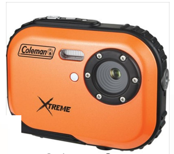
Coleman® Waterproof 5MP Digital Camera