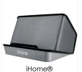
Portable Rechargeable Stereo Speaker System