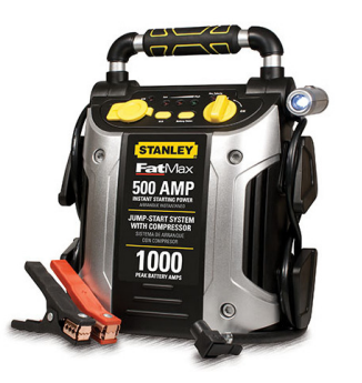
Stanley® 500 Amp Jump Starter with Compressor