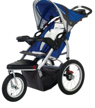
Schwinn® Turismo Swivel Jogger