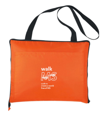
Game Day Stadium Blanket Features Walk MS logo