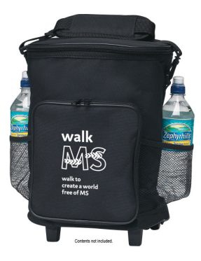
18-Can Rolling Cooler Features Walk MS logo