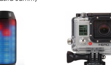
GoPro® HD HERO3 Camcorder Bluetooth Wireless Speaker