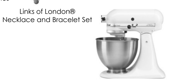
KitchenAid® 4.5-Quart Ultra Power Stand Mixer