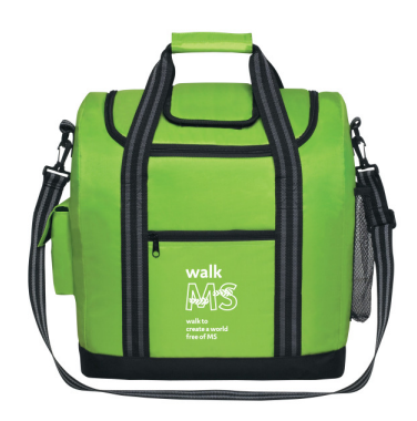
Flip Flap Insulated Kooler Bag Features Walk MS logo