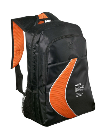
Extreme Backpack Features Walk MS logo