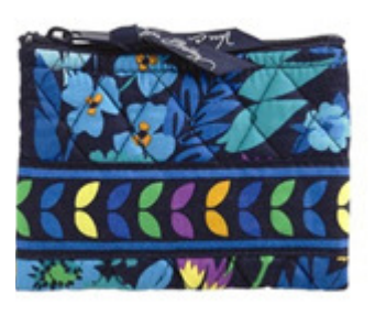
Vera Bradley® Coin Purse