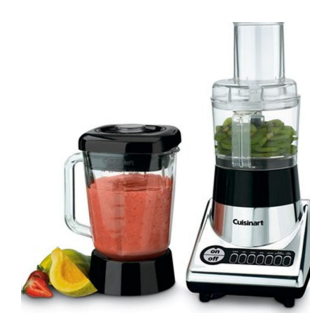
Cuisinart® PowerBlend Duet Blender/Fooc' Processor in Chrome