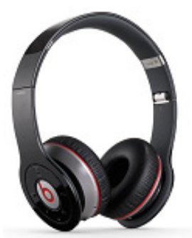
Beats® by Dr. Dre Wireless On-Ear Headphones