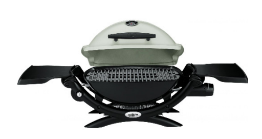
Weber® Q® 1200™ Gas Grill