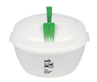
Salad Bowl Set Features Walk MS logo