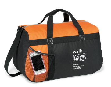
Sequel Sport Bag Features Walk MS logo