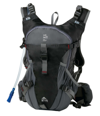
Urban Peak™ Hybrid Hydropack Features Walk MS logo