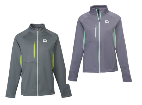
Lancer Full Zip Fleece Jacket Features Walk MS logo Optional Chapter Name Personalization