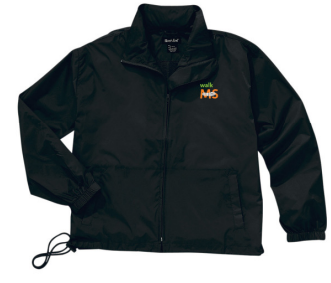
Full-Zip Nylon Anorak Features Walk MS logo