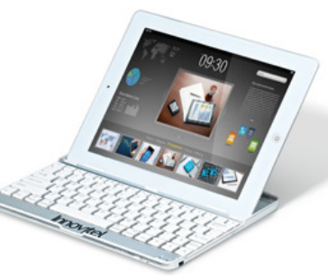
Bluetooth Keyboard Snap On iPad® Case Features Walk MS logo