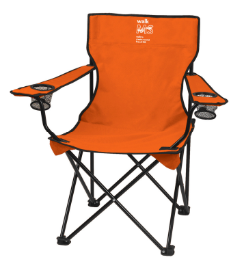
Folding Chair with Carrying Bag Features Walk MS logo