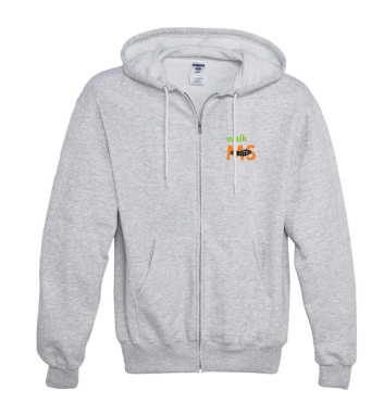
Jerzees® Full-zip Hooded Sweatshirt Features Walk MS logo