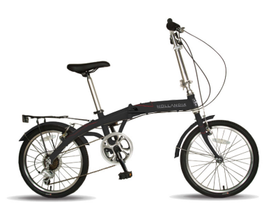
Hollandia® Folding Bike