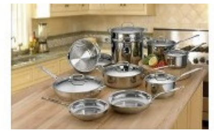
Cuisinart® 17-Piece Cookware Set